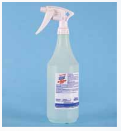
Secondary Container: 32 oz spray bottle is 100% biodegradable** and 100% recyclable.