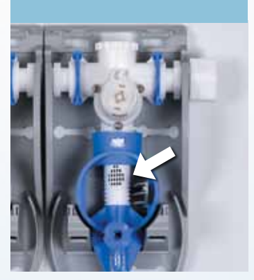
3 Built-in air gap backflow preventer helps against possible backflow.