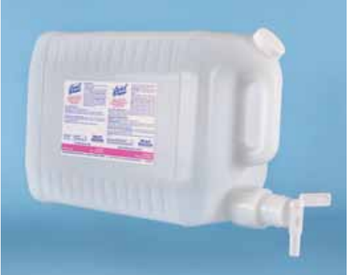
2.5 gallon buddy jug with label.