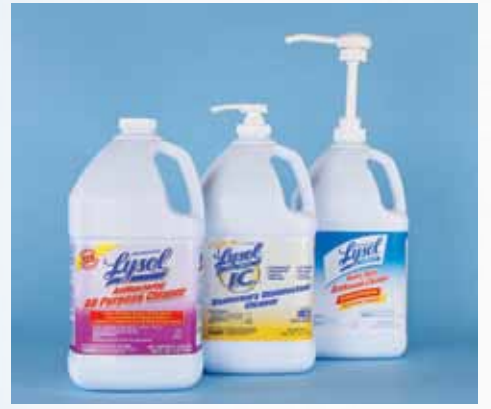
Gallons with 1/4,1/2 and 1 ounce pumps that screw on for easy dilution.

For smaller facilities, manual equipment available based on your facility's requirements.