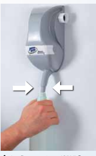
4 1 gallon per minute (GPM) flow allows for convenient manual fill of 32 oz spray bottles. Built-in water flow regulator allows for filling mop buckets and/or trigger bottles quickly and easily.