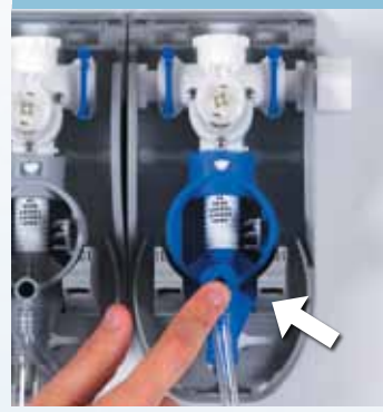
2 Metering peg allows for accurate dilution.