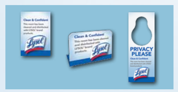
LYSOL® "Clean & Confident" signage helps boost customer trust.