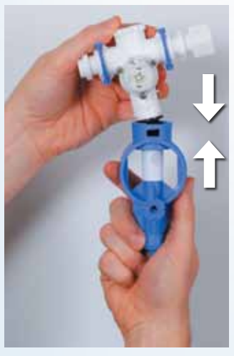
1 Components snap together with no tools.