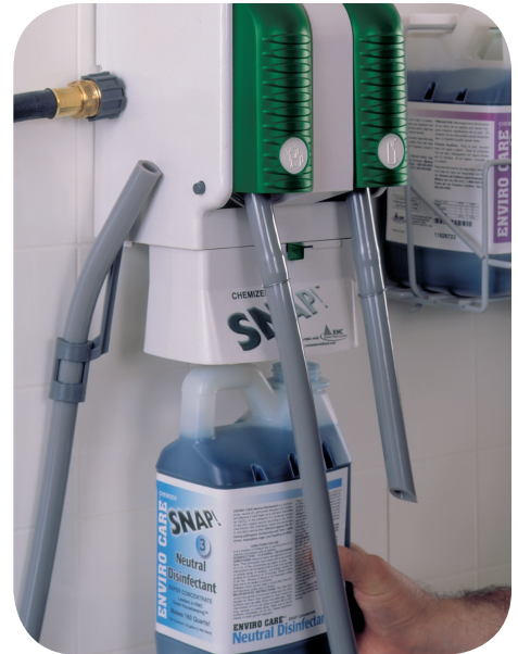
SNAP! Wall Mount Dispenser