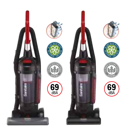
SC5845 15" Cleaning Path