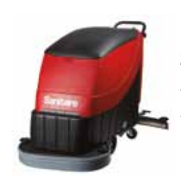
28-Inch Portable Scrubber SC6210

3.5 gallon solution tank and 4 gallon recovery tank cover large areas.