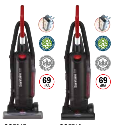
SC5713 15" Cleaning Path 13" Cleaning Path