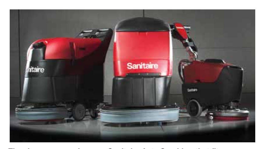
Time is money, so choose a Sanitaire Auto Scrubber that fits your cleaning challenge. Pictured (L-R): 20-Inch Cordless Scrubber (SC6205), 28-Inch Cordless Scrubber (SC6210), 14-Inch Tag Along Scrubber (SC6200). Not pictured: 32-Inch Cordless Scrubber (SC6220).

With the right auto scrubber and auto scrubber parts, bare floor cleaning can be quick and easy. Without them, you are stuck with time-consuming work that involves messy mops, buckets and perhaps a few air movers. Fortunately, there is a better way.